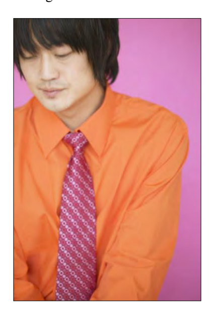
The new employee is too quiet and has no sense of style. We should fire him.

In this fallacy, the conclusion is assumed to be bad because the arguments are bad. In practice, a premise of the argument is bad and therefore the conclusion is bad or invalid. This fallacy is seen often in debate or argumentation. We summarize the fallacy as: He gave bad reasons for his argument; therefore, his argument is bad. Consider the following claim: