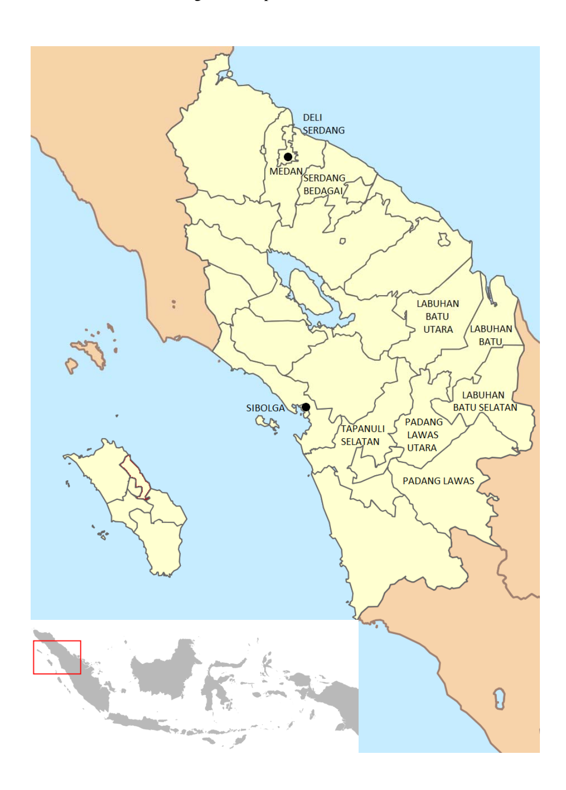
Figure 1. Map of North Sumatra